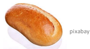
One loaf (of white bread)

(Bemærk, at man som regel udelader "of" i opskrifter: "15 grams salt" i stedet for "15 grams of salt")